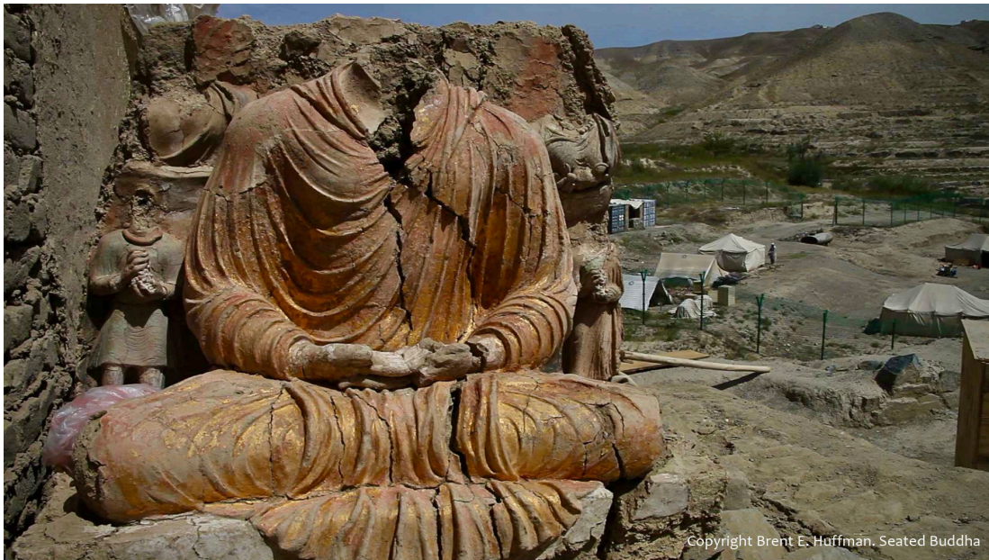
Seated Buddha